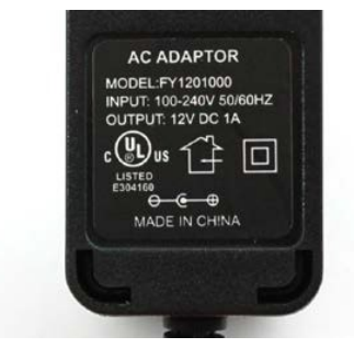
120-240 VAC (will work)

• A popular way to break a printer, alarm clock, or a gaming console is to plug it into a 220-volt outlet without a transformer. Check your appliance's voltage requirements (sticker is near the power supply cord). If it has electric motors or produces heat, be extra careful.