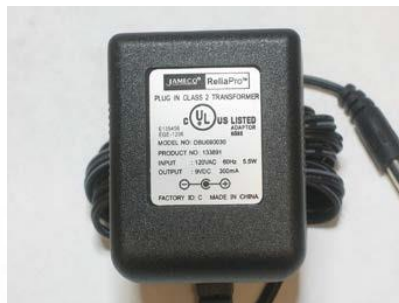
120 VAC (will not work)