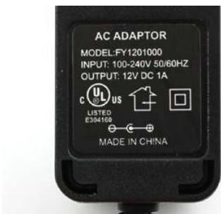
120-240 VAC (will work)