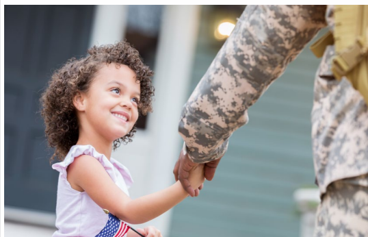
Access to guns that are not stored safely and securely greatly increases the risk of child injury or death.