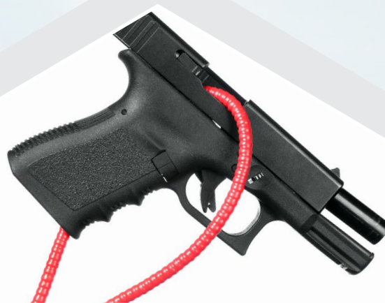
Secure firearms with cable locks in a lockable safe.

In the past decade, the suicide-by-firearm rate among 10- to 14-year-olds has increased by more than 200%.