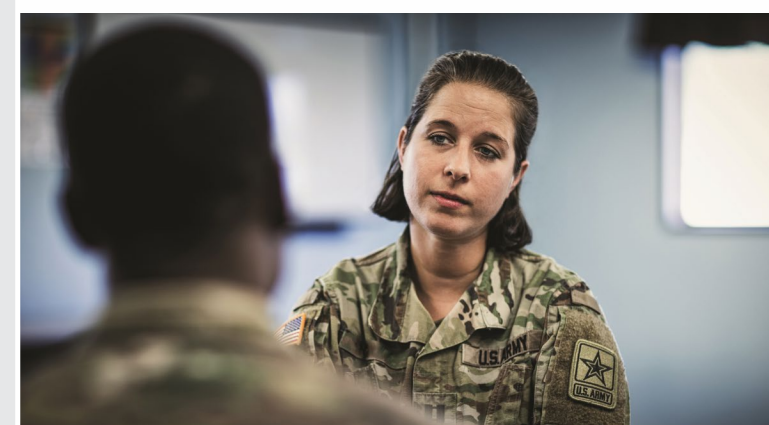
If someone you know is going through a tough time, offer to store their firearms.