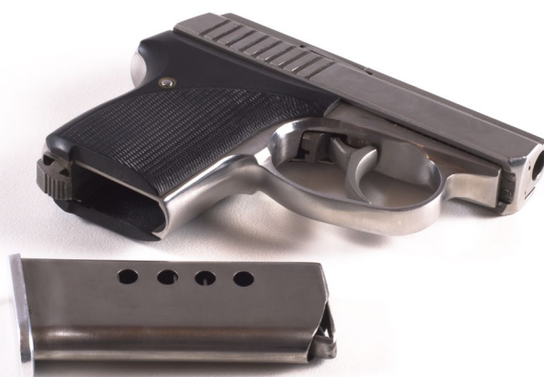
Unload firearms before you store them.