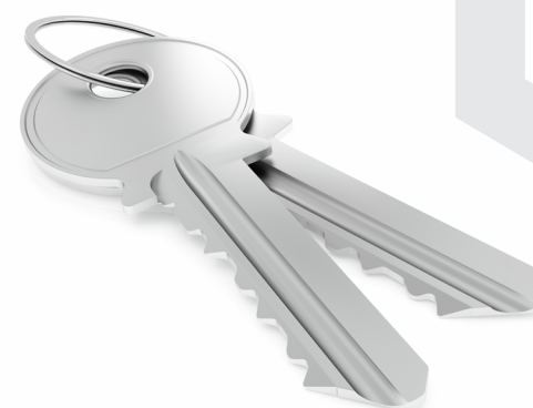
Place keys to ammunition and firearms storage in separate locations.