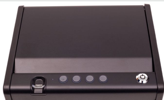
Lock ammunition in a separate container.