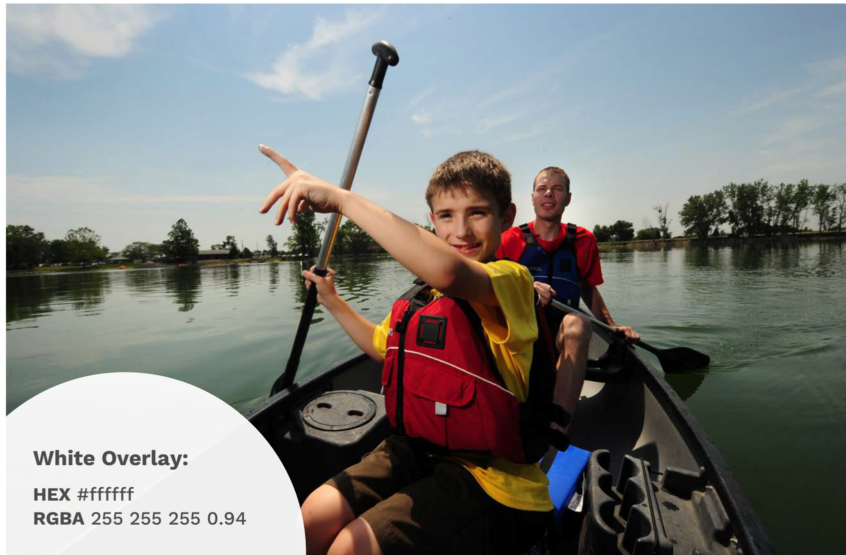
Home - Hero Background Image

The use of photography on the site is limited in order to bring focus to the task at hand or the checklist content.