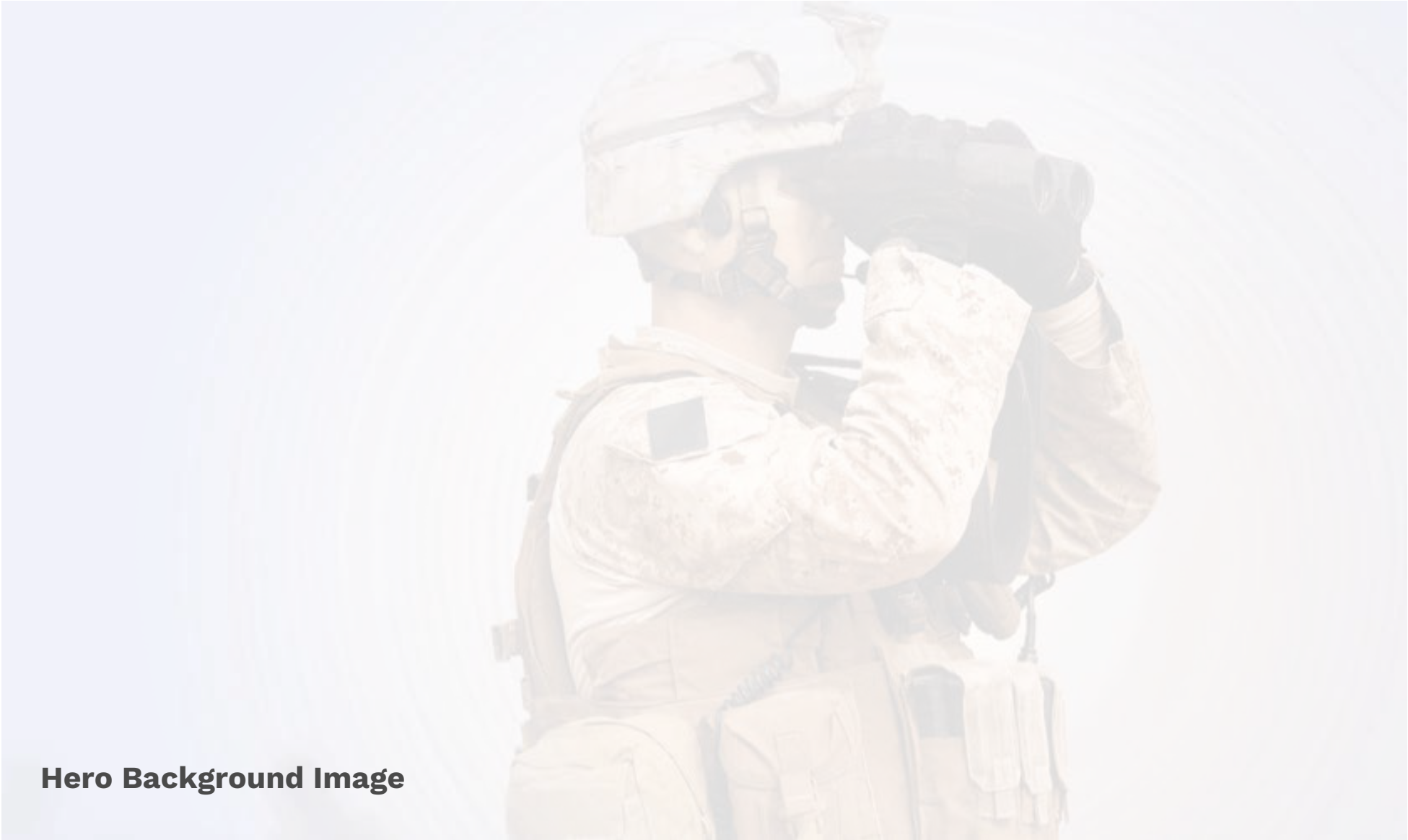
Hero Background Image

The hero image is present on all the 404 page templates.