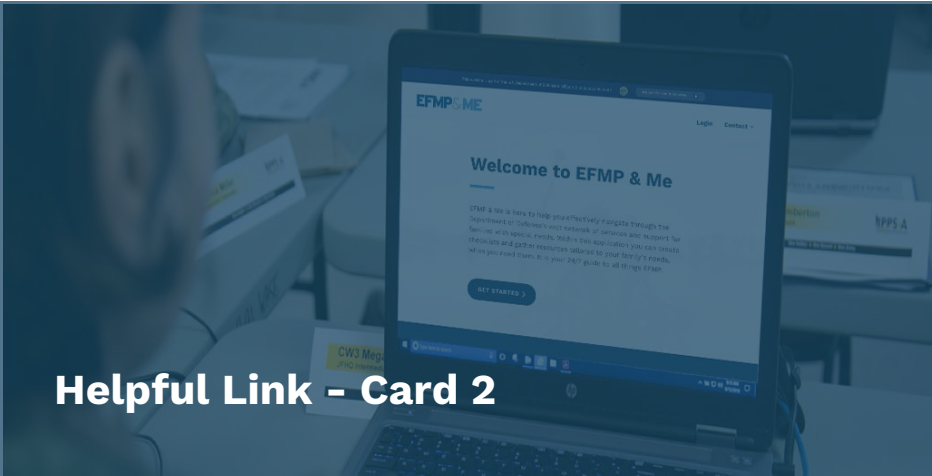
Helpful Link - Card 2